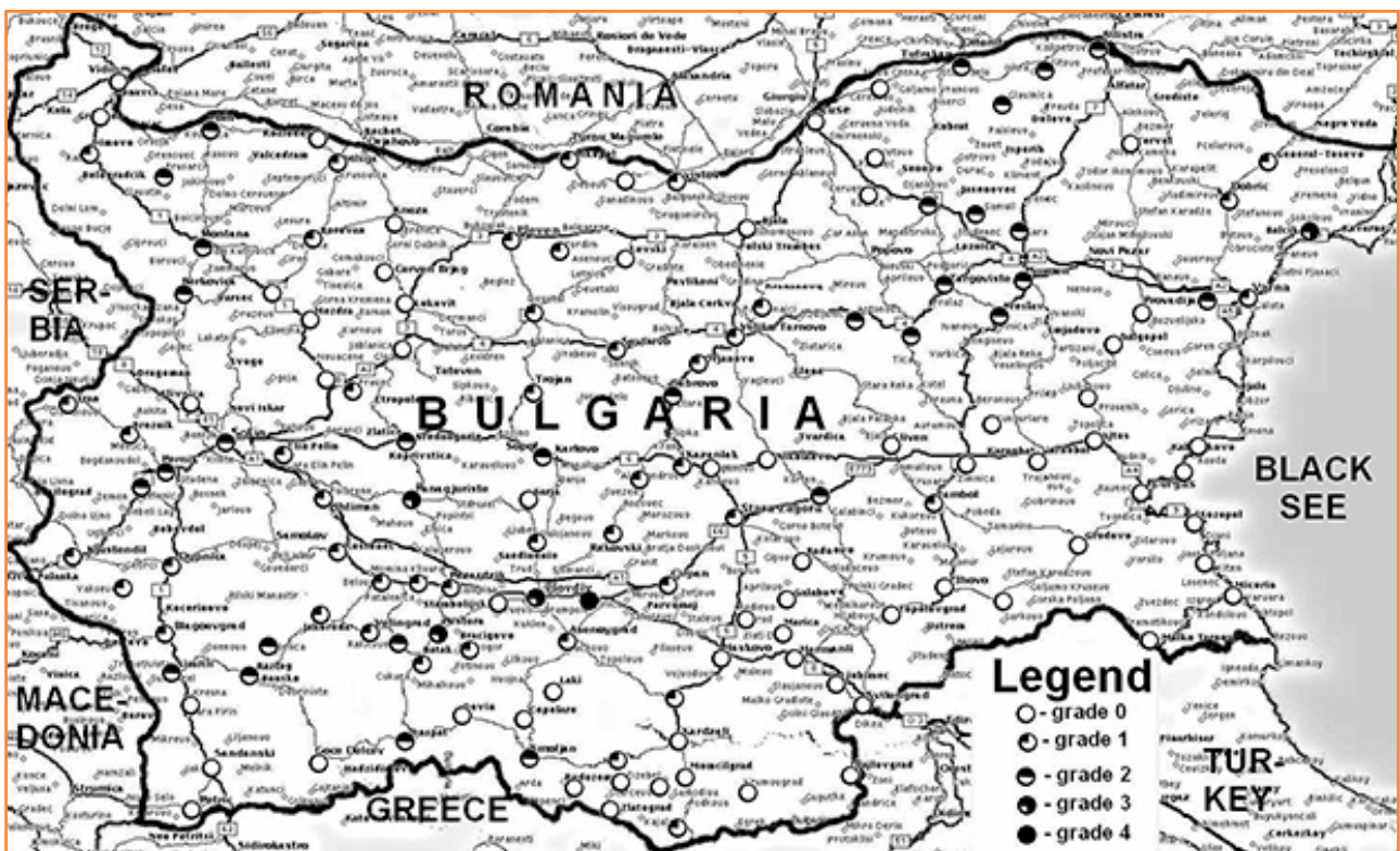
Figure 3 Distribution and infestation of Phorodon humuli on plum and cherry plum in Bulgaria during 2013–2018