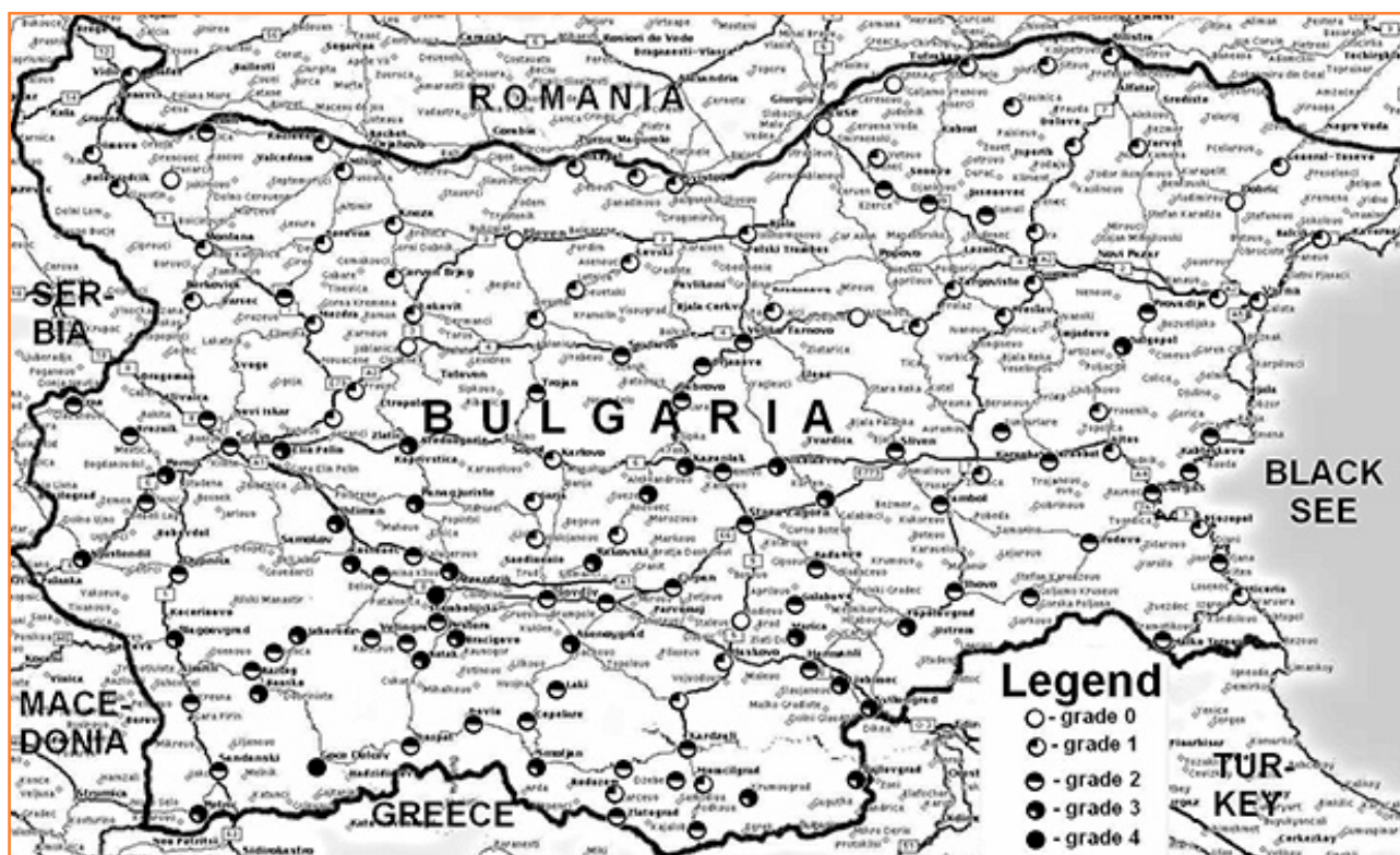
Figure 1 Distribution and infestation of Brachycaudus helichrysi on plum and cherry plum in Bulgaria during 2013–2018

Phorodon humuli is the third most widespread species in Bulgaria (Fig. 3). It was found in more than a half (80) of the surveyed 143 municipalities. The highest density of the aphid was recorded in the Sadovo municipality – more than 50% infestation on shoots. In the municipalities of Peshtera and Panagurishte, the infested shoots made up 38.4% and 28.4% of the whole, respectively. The species was not found in 62 municipalities – 19 in northern Bulgaria and 43 in southern Bulgaria. This includes the whole districts of Burgas, Rouse and Haskovo. The pest has a preference for