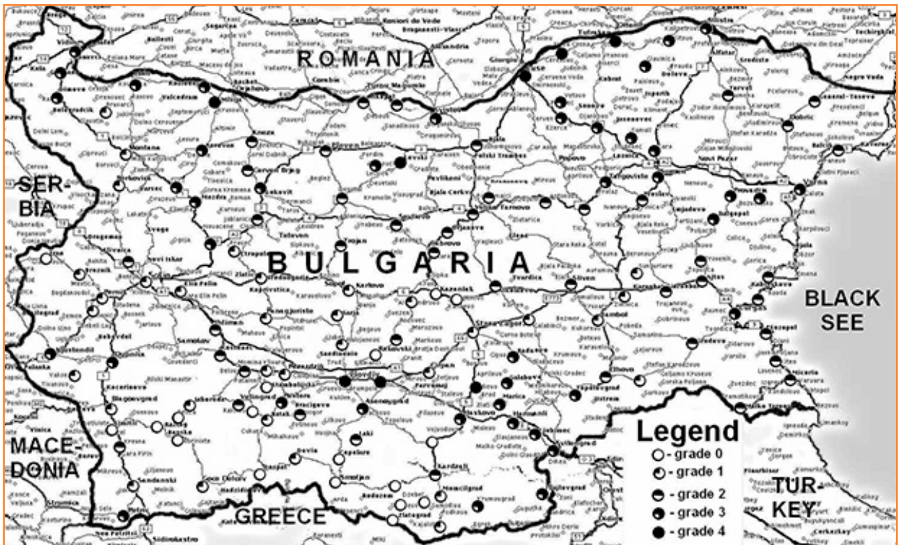
Figure 2 Distribution and infestation of Hyalopterus pruni on plum and cherry plum in Bulgaria during 2013–2018