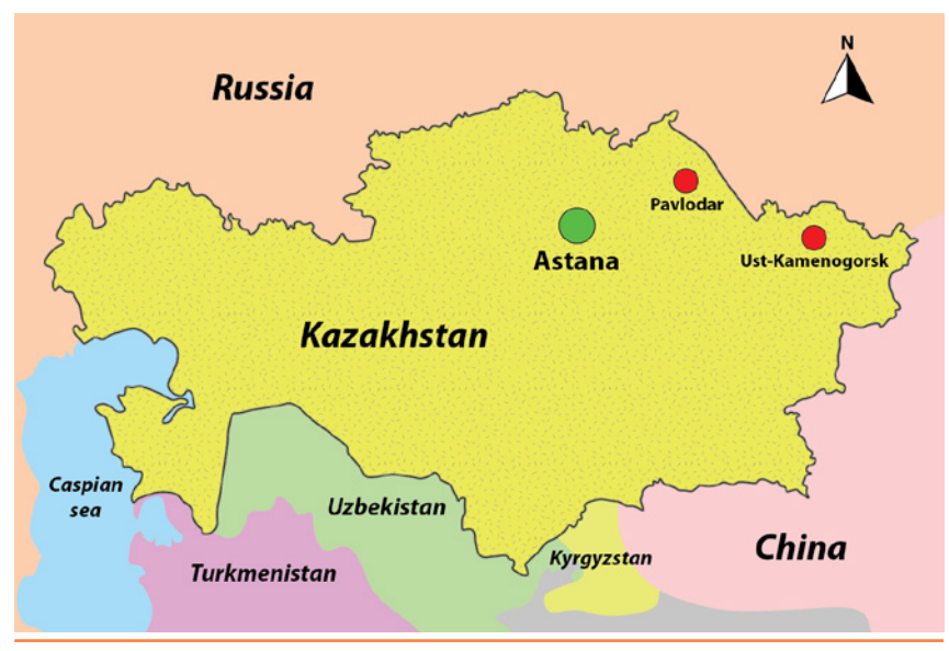
Figure 2 Locality of research

to water from the main resource which is river Irtish. Beside water, also reasonable quality of soil is limited, because of salinization. A fast increase of area for potato will early come to its limits in this continental climate. High temperatures and humidity are important factors supporting virus PVY (Iftikhar et al., 2020). Therefore changes in irrigation leading to drip technology should be placed as well as biotechnologies for better resistance against virus.